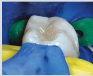
zmack ® comp