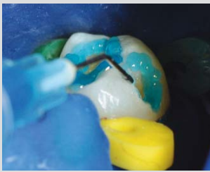
zmack ® etch