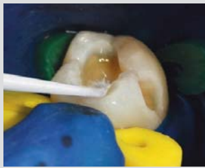
zmack ® bond